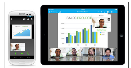
Figure 3. Meet from Any Device

Enjoy a rich meeting experience with audio, video, and content sharing across Android, iPhone and iPad, BlackBerry 10, and Windows Phone 8 devices.