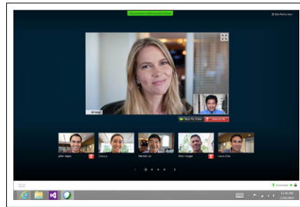
Figure 2. View of Full-Screen Mode

Make it even easier for others to join you in your Personal Room through the WebEx Video Bridge. People can join your video conference through any standards based video system.